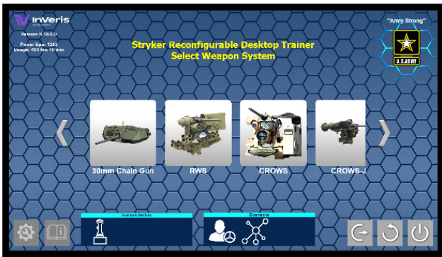
User Interface - Start Menu