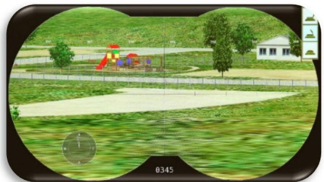
Commander Day/II Binocular Views

The RDT supports training with or without instructor supervision, allowing for greater flexibility in training management. Control of the training session can occur from a single station with all results recorded, and crews can progress at their own pace without continuous supervision. Training results and scores are maintained in the system database, accessible only by their respective crews