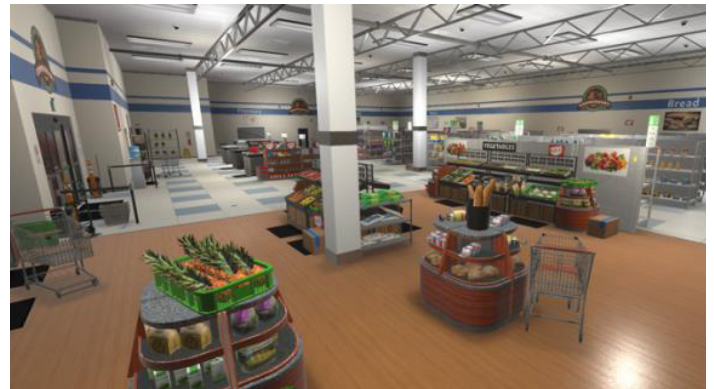
A base commissary with multiple sections and checkout lanes.