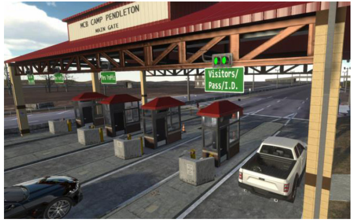
A base gate modeled exactly after a real gate at Marine Corps Base Camp Pendleton.

Reach out to InVeris Training Solutions today for a free demo to see how fats® VR can enhance your training program.