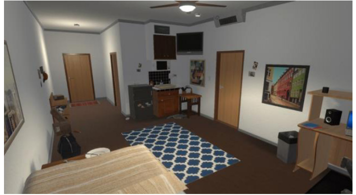
A base housing unit.