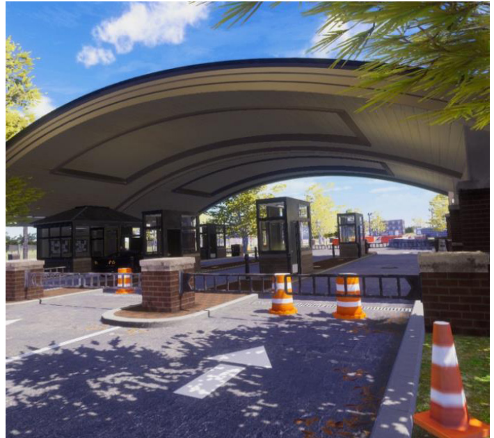
A base gate modeled exactly after a real gate at Air Force Joint Base McGuire-Dix-Lakehurst.