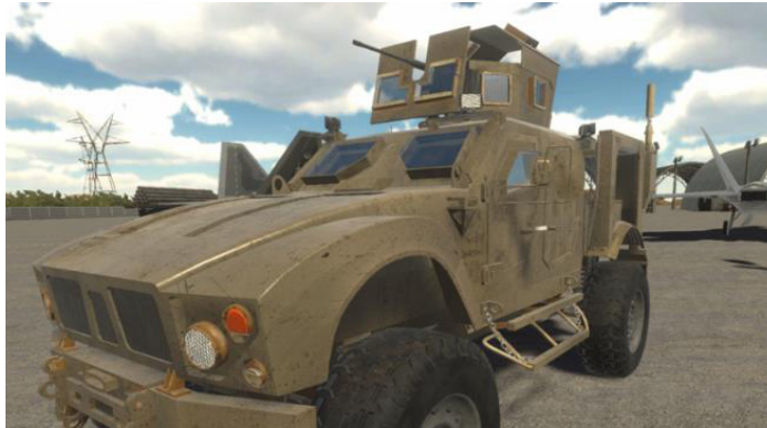
A custom-modeled Oshkosh M-ATV usable that can be dragged and dropped onto an environment as a prop.