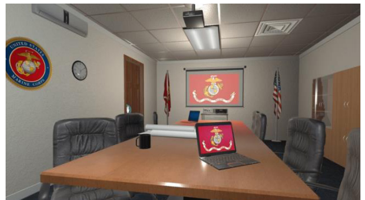
A conference room on a Marine Corps base.