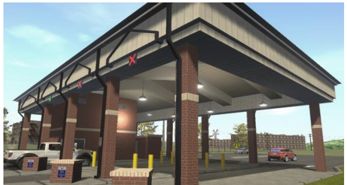
A base gate modeled exactly after a real gate at Robins Air Force Base.