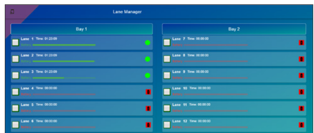
View multiple bays and lanes, time remaining and battery level.