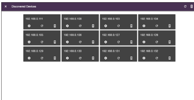
The administrator screen shows reboots and updates.

The advanced RM9K provides numerous training scenarios in an easy to use, fully customizable system.