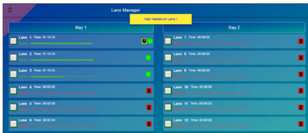
Help button is easily accessed through the ICU.