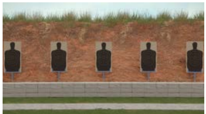
Vivid, realistic 3D environment including 3D paper targets.